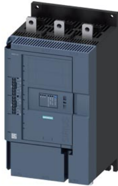
SIRIUS soft starter 200-600 V 210 A, 24 V AC/DC spring-type terminals Thermistor input