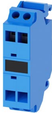
Support terminal, blue, spring-type terminal, for front plate mounting