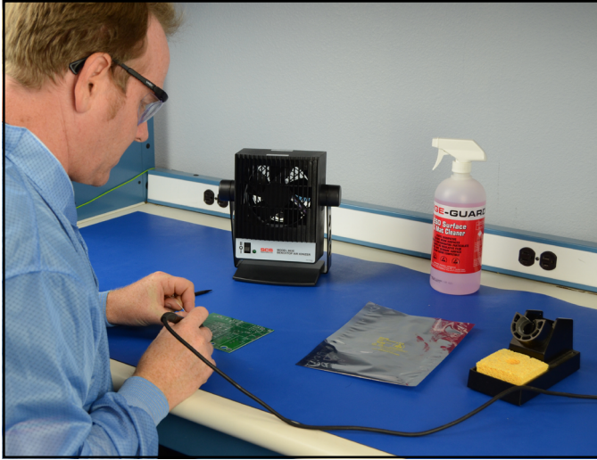
Figure 2. Using the 963E Benchtop Air Ionizer