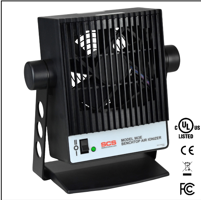
Figure 1. SCS 963E Benchtop Air Ionizer

The 963E Benchtop Air Ionizer and its accessories are available as the following item numbers: